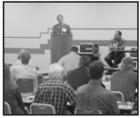
A speaker addresses the Lake Eastex briefing session in Jacksonville.

Representatives from 18 of the 20 Lake Eastex participants attended. These included Afton Grove Water System Corporation (WSC), City of Arp, Blackjack WSC, Caro WSC, Cherokee County, Craft Turney WSC, Jackson WSC, City of Jacksonville, City of Nacogdoches, City of New London, New Summerfield WSC, North Cherokee WS, Reklaw WSC, City of Rusk, Rusk Rural WSC, Stryker Lake WSC, Temple-Inland, Inc., City of Troup, City of Tyler, and City of Whitehouse.